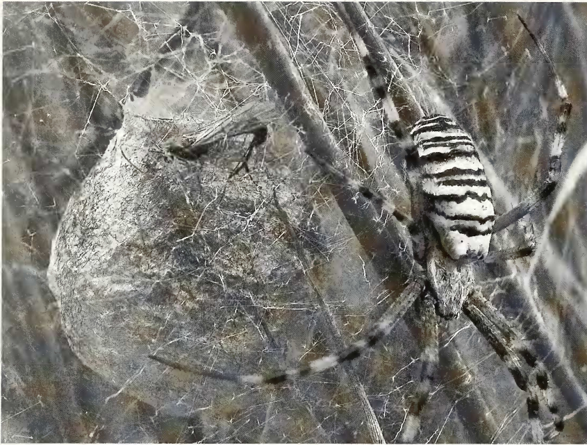
Figure 4: Tromatobia ornata on egg cocoon of Argiope bruennichi .